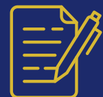
FREE WILL WRITING SERVICE

Staff can work across our family of schools, enabling our academies to benefit from wider expertise and to offer individuals fresh opportunities. Quality of life outside work significantly shapes the way in which people perform, so the need to achieve a healthy work/life balance is an important aspect of our commitment to staff.